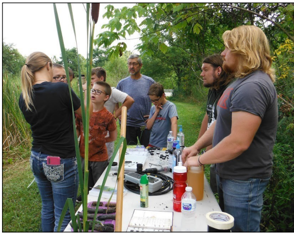
California University students demonstrate various water testing procedures.