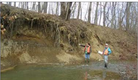
Bank erosion issues and stability issues.

In order to develop a sound approach on how to proceed with restoration work within the Sewickley Creek Watershed, SCWA applied for and received DEP funding to complete a watershed assessment by the Western PA Conservancy Watershed Conservation