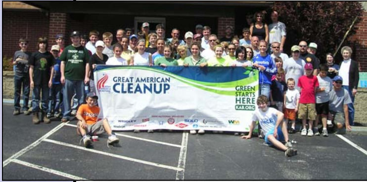
Ninety-six volunteers turned out for the cleanup event on April 25th.

On April 25, SCWA partnered with Westmoreland Cleanways, the borough of Youngwood’s fire department, recreation board and employees, and the PA Resources Council to celebrate the Great American Cleanup of PA 2009 by picking up roadway litter and cleaning an illegal dump site in the area. The event was part of the fifth annual statewide event promoted by Keep PA Beautiful .