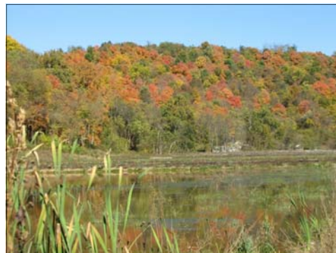
A view of the expansive wetland area at the Marchand System.

The Governor's Award for Environmental Excellence is awarded to select PA businesses, government agencies, educational institutions, non-profit organizations, individuals, farms or agri-businesses engaged in efforts to promote environmental stewardship and economic development.