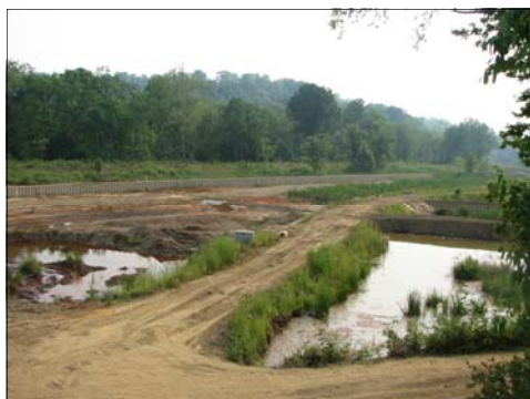
Continued disturbance to the narrow berms at the Brinkerton site may cause damage to the existing settling ponds.

If you have any information pertaining to illegal activity occurring at the Brinkerton mine drainage treatment system, please contact the PA Fish and Boat Commission at (814) 445-8974 or the PA Game Commission at (724) 238-9523.