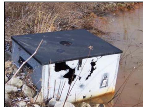
This water elevation control box was recently vandalized at the Brinkerton treatment system site.

Over the past ten years, SWCA and its partners have been working diligently to control and treat a large abandoned mine discharge near the small town of Brinkerton located in Mount Pleasant Township. An 8-acre treatment system was recently constructed, and brought online in October, 2008 to treat the largest discharge in the Sewickley Creek Watershed. The system is working as expected, removing nearly 80% of the iron from the more than 2,000 gallon per minute discharge flowing into Sewickley Creek. Unfortunately, this successful system has become the site of some very discouraging events as of late.