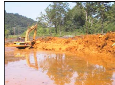
Iron Oxide sludge will be recovered from the settling ponds every 5-10 years.

In 1999, SCWA and IOR joined together to find a solution to treat the abandoned Marchand Mine Discharge located in Lowber, Westmoreland County. The abandoned mine had been discharging up to 2,500 gallons per minute of iron-laden, polluted water into Sewickley Creek for decades. As a result, large deposits of iron sludge already existed on the site, deemed by Hedin as ideal for supporting iron oxide recovery experiments.