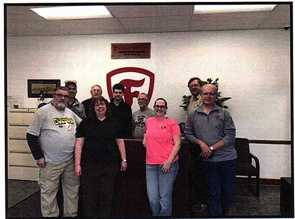
Firestone Building Products, Youngwood, and SCWA Volunteers assembled and painted 26 bluebird boxes.