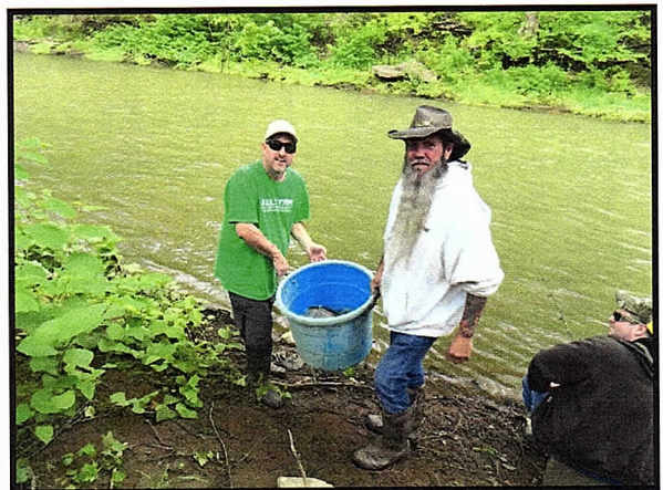
In addition to installing the new bluebird and bat boxes, volunteers are needed to help stock Sewickley Creek. Contact (724) 610-0829 to volunteer!