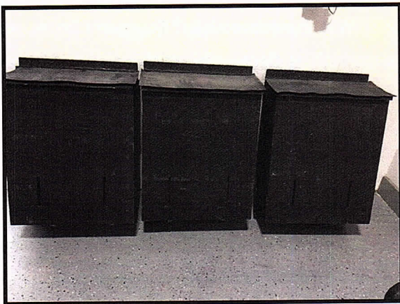
Firestone Building Products purchased 3 bat houses fully assembled to be installed by SCWA in the spring.