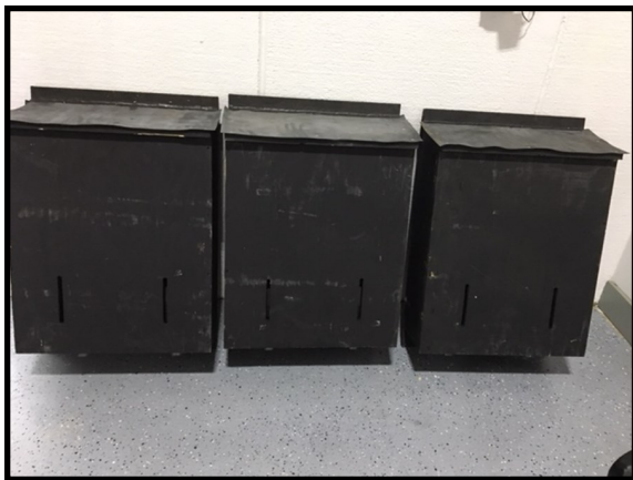
Firestone Building Products purchased 3 bat houses fully assembled to be installed by SCWA in the spring.