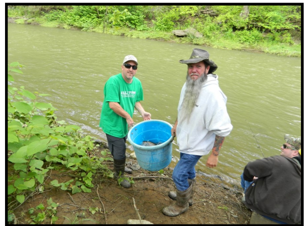
In addition to installing the new bluebird and bat boxes, volunteers are needed to help stock Sewickley Creek. Contact (724) 610-0829 to volunteer!