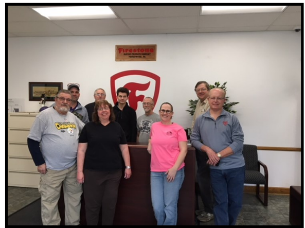
Firestone Building Products, Youngwood, and SCWA Volunteers assembled and painted 26 bluebird boxes.